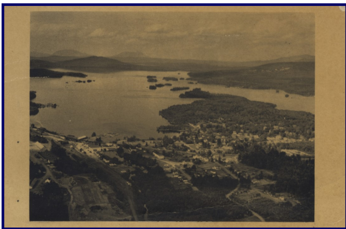
Aerial view postcard of Moosehead Lake & the West Cove in the early 1900s.