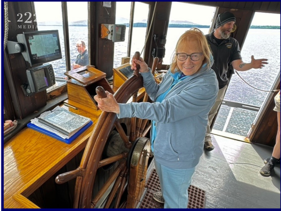
A guest "Captain" aboard the Kate! Passengers are invited to visit the wheelhouse mid-cruise and take a turn piloting the Katahdin.