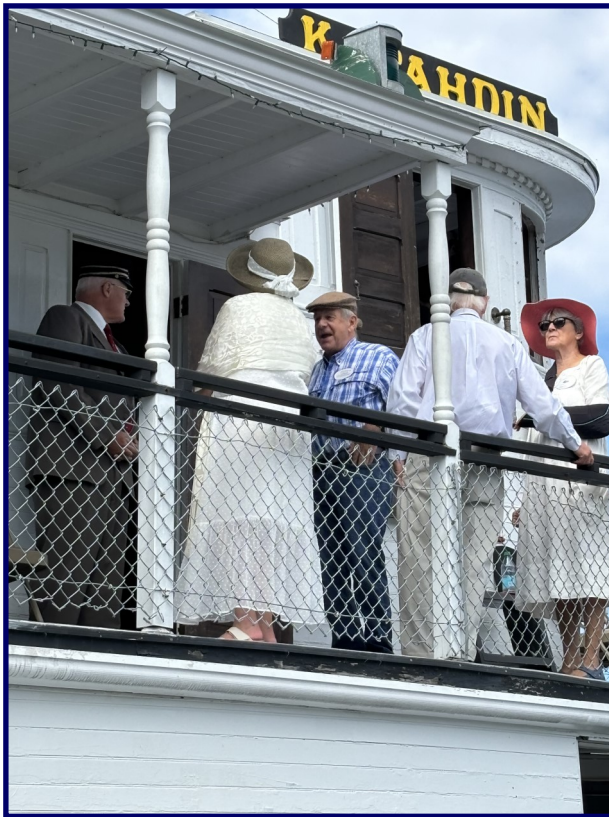
MMM Board Members, friends and crew celebrate aboard the Kate at her 110th birthday party!