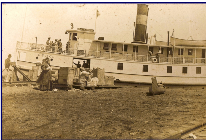
The Katahdin I in the early 1900s. Built in 1896, burned on May 13, 1913, she was 111' long and 28' at the beam.

-originally printed in the 1982 MMM Newsletter