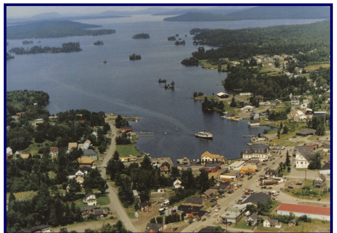
Aerial View postcard of Moosehead Lake & the East Cove in 1992.