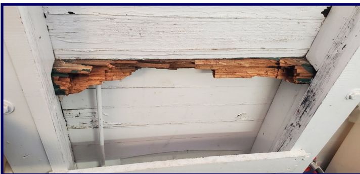
A section of the green rail fractured during the demolition phase of the port deck replacement. This photo shows how water causes the rail to deteriorate.

The actual replacement initially involves precisely measuring and planing the lumber that will be used for the cap rail. Then the shipwrights assemble the pieces, which must lock together and fit securely onto the bulwark. When completed and painted, it will look again like a single railing encircling the boat. This is time-consuming, painstaking, and exacting work done by very skilled and experienced craftsmen from Bristol Marine at the Shipyard in Boothbay Harbor. Phase III will begin, as planned in the fall of 2024.