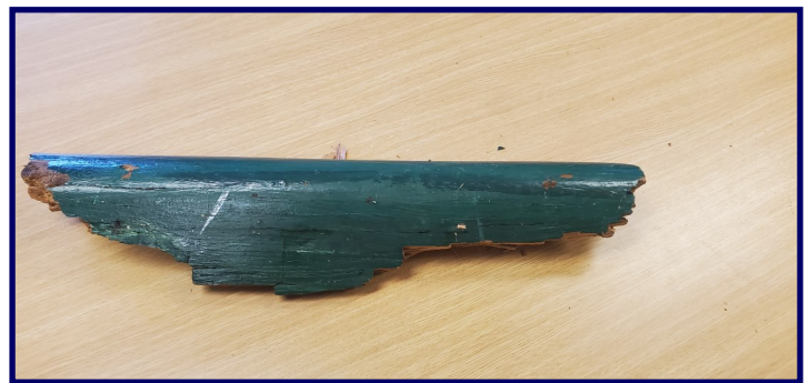
This is the section of green rail that detached itself from the wall in the Katahdin's galley.