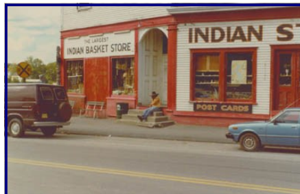
The old Indian Store in downtown Greenville.