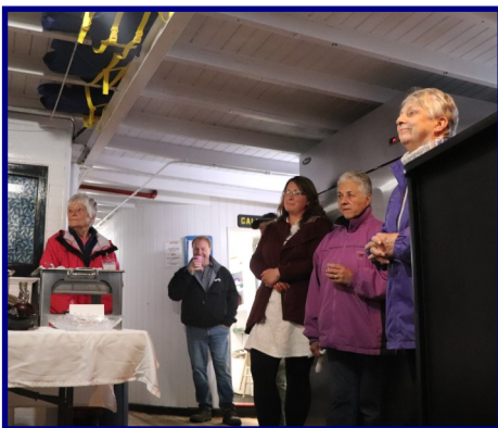
In addition to the Donors Cruise in June 2022, MMM hosted two additional cruises in July and September to introduce the Keep the Kate Cruising Campaign.