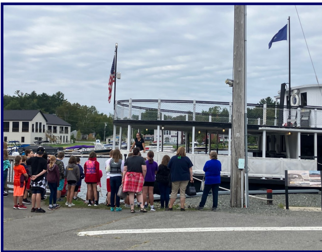
We had special visitors aboard the Kate in September! Over three weeks, a total of 250 middle- and high-school students from Piscataquis County visited the museum and Katahdin for 2-hour cruises focused on field experiences in marine ecosystems.