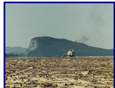
The Katahdin towing a log boom.

"THE KATAHDIN— LAUNCHED ON JULY 16, 1983..."