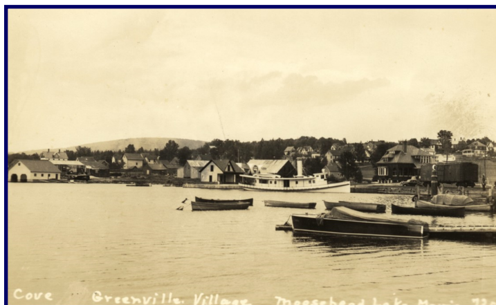
An unidentified steamer (possibly the Louisa or Priscilla ) in the East Cove at the present site of the Moosehead Marine Museum during the Coburn Steamboat Era, circa early 1900s.