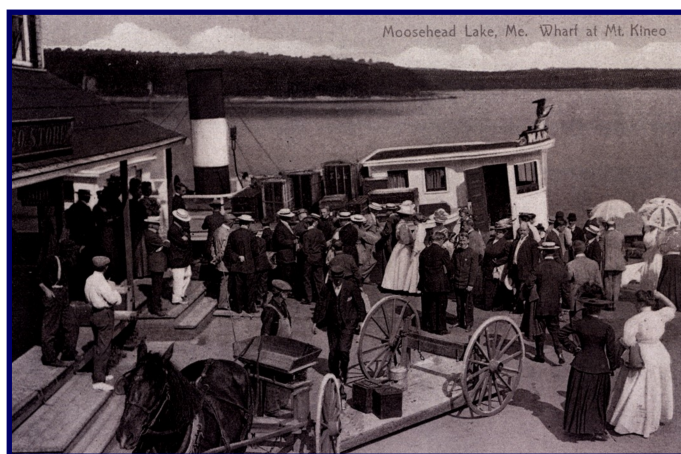
The steamer Marguerite picking up passengers at the Mt. Kineo wharf. The Marguerite is recognizable for having an eagle with spread wings mounted atop her wheel house.