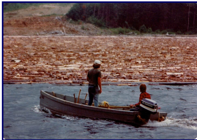
Men in boats collecting loose logs from log booms—July 1975