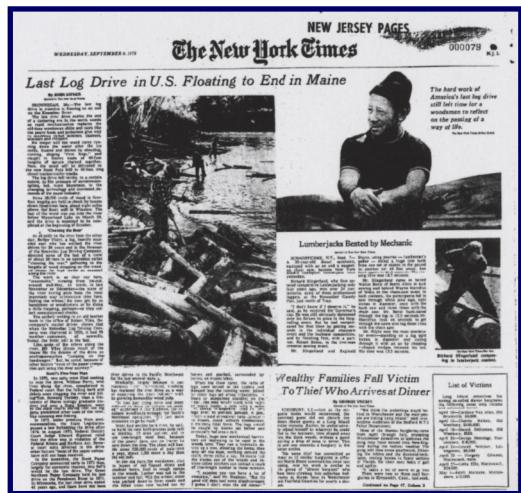
New York Times article from September 19, 1976— "Last Log Drive in US Floating to End in Maine"

THE LAST LOG DRIVE 50TH ANNIVERSARY CRUISE JULY 12, 1975 JULY 12, 2025