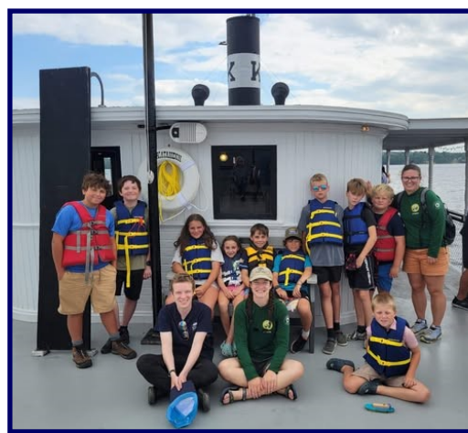
Maine Woods Explorers campers aboard the Katahdin for our Sugar Island cruise.