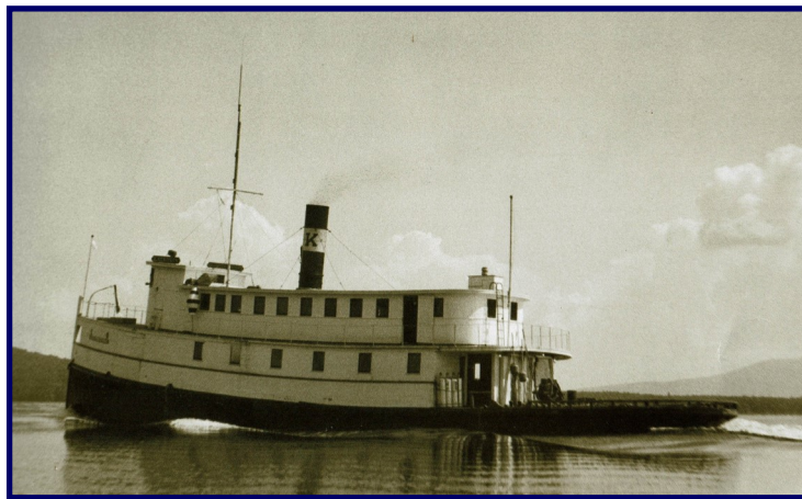
The Katahdin during the Scott Paper era. Her upper fantail had been removed for logging operations.