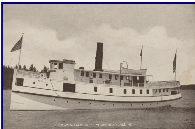
Katahdin I was built in 1896 at Shipyard Point, near the present site of Kelly's Landing in Greenville Junction. The first Katahdin was built with a wooden hull. In 1913, she caught fire near Sandbar Island, south of Mount Kineo. She was run aground by her skipper and burned to the water's edge. None of the crew were harmed. Divers have located and retrieved relics from the wreck of the first Katahdin – some of these are on display in the museum.

A selection of vintage postcards acquired by MMM in 2025, now part of the museum's collection.