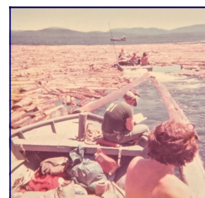
Booming out in Spencer Bay—wrapping the boom

As the years progressed, I began to gradually realize what a unique adventure I had experienced during my time on the Scott Paper log drives. I am forever grateful for growing up in Greenville, which prepared me for my time on the log drive and beyond. Whenever I think about those years of working on the drive I always have a smile on my face.